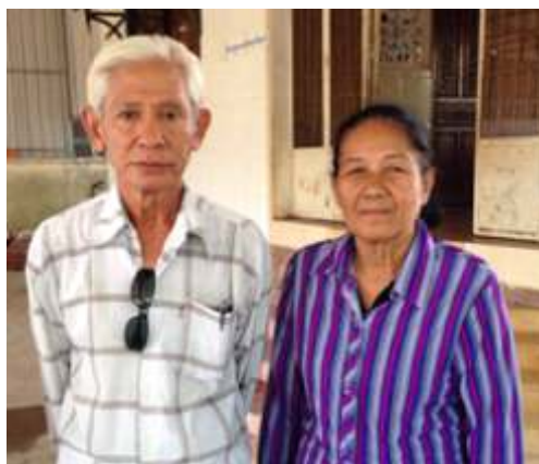
Carers for the boys

A Cambodian married couple are now employed at the Children's Home to love and care for our boys. The Cambodian Child Protection Policy requires that the boys and girls live in separate quarters and each have their own carers. We are so fortunate to have dedicated carers to fulfil these roles. If you would like to help support these positions financially, we would love to hear from you.